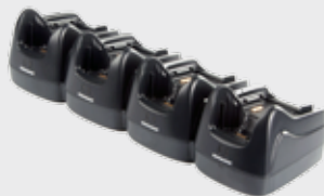
■ 94A150037 4-Slot Charging Dock ■ 94A150038 4-Slot Ethernet Dock